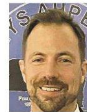
SOUTHAMPTON SCHOOL DISTRICT